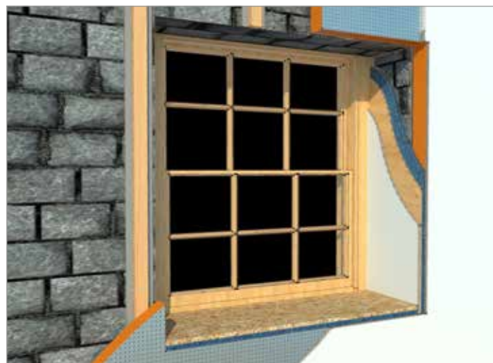
Image showing Spacetherm WRB applied internally to a reveal on an existing external wall structure.